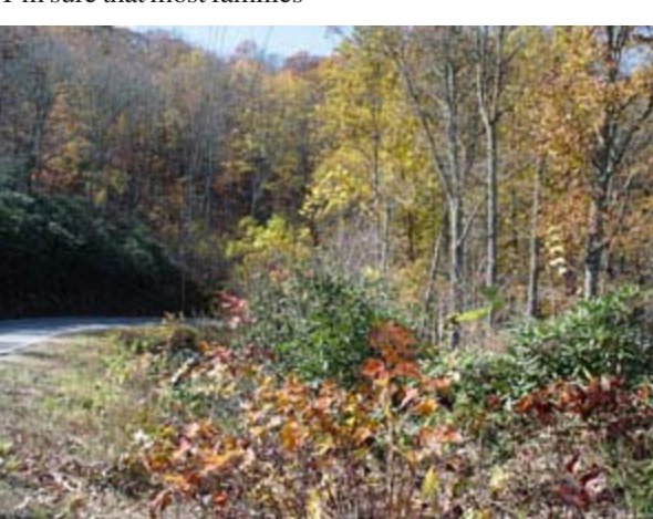
On SC 107 headed north

Quite clearly the moral teachings in the New Testament grow out of the foundation laid in the OT Israelite faith. One of the basic principles grew out of the OT Holiness Code mandate (Lev. 19:2, NRSV): You shall be holy, for I the Lord your God am holy. The imperative for God's people to behave themselves a certain way grows out of the character and behavior of their God. The worshippers' conduct is supposed to be guided by the con-