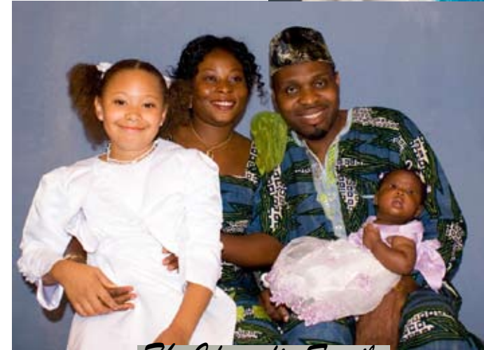
The Idemudia Family