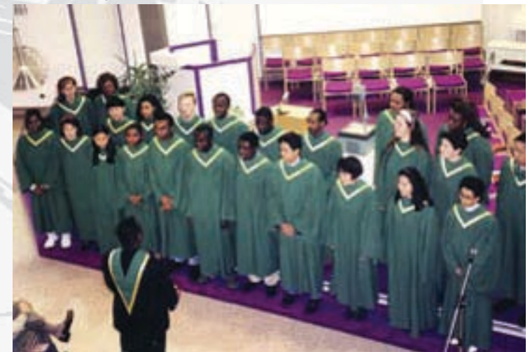
A part of the IBC Cologne gospel choir from the mid-1990s. In those days the 75 plus member choir was quite a witness for Christ in our city and beyond. What about the future?

“Thanks be to God who gives us the Victory through our Lord Jesus Christ” 1 Cor. 15:57