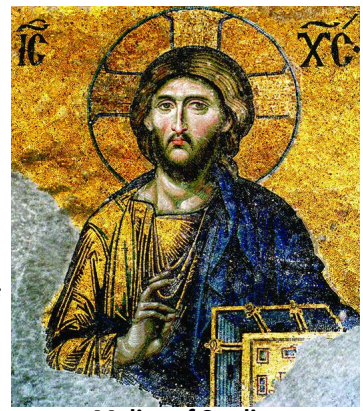
Melito of Sardis

the capital of the Lydian empire centuries before the beginning of the Christian era produced a sense of pride and elitism that combined with its enormous wealth with the consequence of generating an atmosphere of complacency and toleration that proved deadly to the church in the city. More moderate estimates