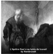
L'Apôtre Paul à sa table de travail by Rembrandt

An Overview Survey of the Contributions of this Christian Leader