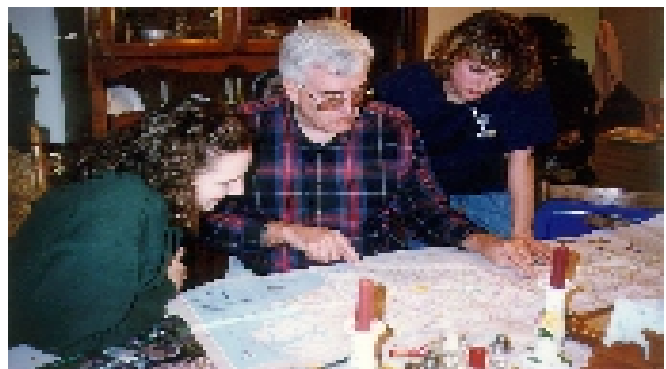
planning our week of activities with the girls

Thinker's Daily Ponderable by Alan Harris http://users.aol.com/alhinil/tdp.htm