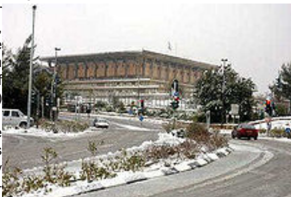
Snow in modern Jerusalem

Climate patterns in modern Israel underscore this for ancient Israel. Although a “Mediterranean climate” with “long, hot, rainless summers and relatively short, cool, rainy winters” the temperature can easily dip to the freezing level or below in winter with occasional snow at the higher elevations. 10 One of these places would be Jerusalem at 835 meters (or 2739 feet) in elevation.