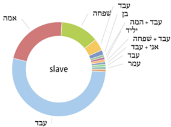
The Two Charts above reflect both the Greek words in the NT and the Hebrew words in the OT for 'slave.'