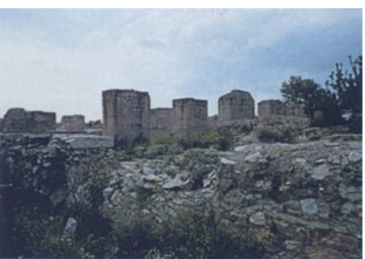
The ruins of Thyatira in ancient Asia Minor (modern Turkey)