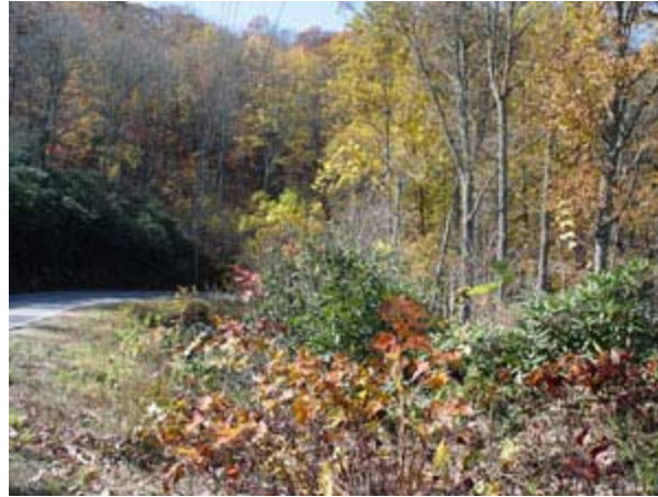
On SC 107 headed north

We have missed many of our Sunday School parties recently and finally were able to make the latest one. What a