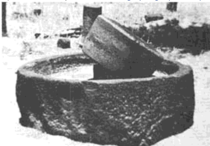
Millstones, representative of numerous basalt implements found at Tell Hûm (W. S. LaSor)

The narrative intro in v. 21a is very short: Καὶ ἦρεν εἷς ἄγγελος ἰσχυρὸς λίθον ὡς μύλινον μέγαν καὶ ἔβαλεν εἰς τὴν θάλασσαν λέγων· And one mighty angel picked up a