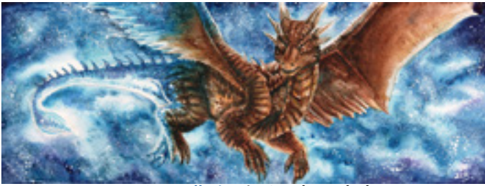
Draco Constellation in Greek Mythology

in the OT: לִיְוָיָתָן liwyātān , Leviathan (4x) and תַּנִּין or תַּנִּי tannîn , serpent, sea-monster (15x). 11 Unlike the medieval dragon which is a land oriented animal, this dragon was closely identified with the great sea, the Mediterranean, and with snakes. Additionally a constellation of stars was known as δρᾶκων or Draco as well was well known. 12 In the Greco-Roman background this image was a clear symbol of evil. 13 Again the location is ἐν τῷ