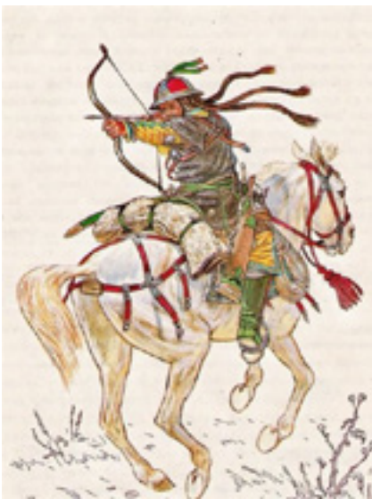
Feared Parthian Cavalryman

The image of conquest suggested by the white horse has raised questions about the identity of the rider. The situation is made more complex with the almost identical phraseology being reproduced in Rev. 19:11, where the rider is clearly identified as Christ. 33 But clearly a