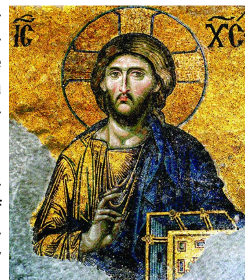
Melito of Sardis

the capital of the Lydian empire centuries before the beginning of the Christian era produced a sense of pride and elitism that combined with its enormous wealth with the consequence of generating an atmosphere of complacency and toleration that proved deadly to the church in the city. More moderate estimates