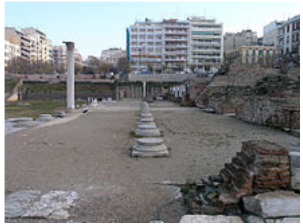
Stoa of the ancient agora of Thessaloniki

mensarii , who were public bankers appointed by the state. The mercatores were usually plebeians or freedmen. They were present in all the open-air markets or covered shops, manning stalls or hawking goods by the side of the road. They were also present near Roman military camps during campaigns, where they sold food and clothing to the soldiers and paid cash for any booty coming from military activities.