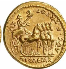
A Roman aureus struck under Augustus, c. AD 13–14; the reverse shows Tiberius riding on a quadriga , celebrating the fifteenth renewal of his tribunal power.