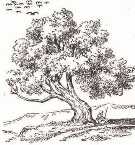
fig tree in its leaves during spring time. This signals the coming of summer when figs can be harvested from the tree. The fig tree in Palestine was one of the first trees to sprout leaves in the spring and held a particularly barren appearance through the winter months. Luke's addition "and all the trees" is possibly an addition to his Markan source for the benefit of readers elsewhere in the Mediterranean world who were unfamiliar with the fig tree. The point of the comparison is clear: Just as

Luke especially points to the greening up of the