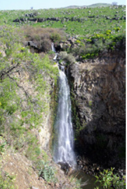
50 meter high waterfall at Gamla in one of the Golan national parks.

ty coming out of the world which God created. Although the sound in heaven wasn't that of a large waterfall, it had a similar impact upon John as he heard it.