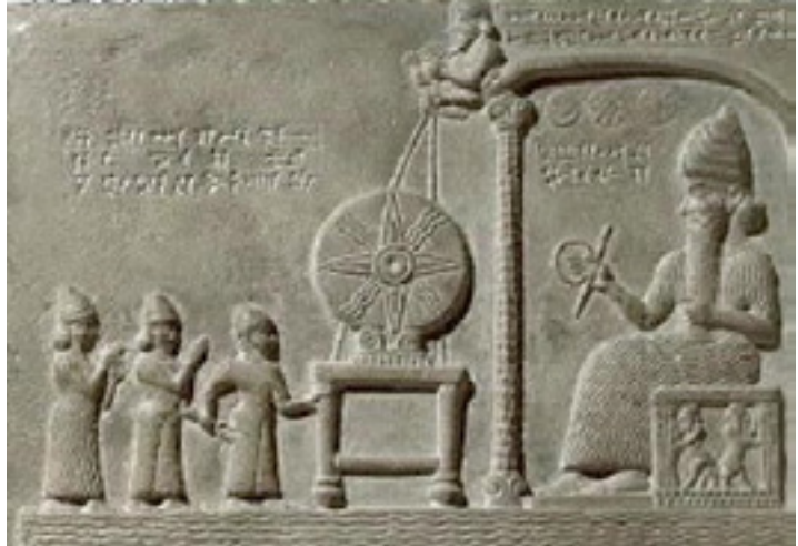
Measuring rod and coiled rope depicted in the Code of Hammarubi. The upper part of the stela of Hammurapis' code of laws. Public Domain.

it.<sup>8</sup> From existing ancient Jewish documents and recent archaeological analysis, the outer dimensions of the were about the equivalent of 35 American football fields. The temple itself was located inside the outer court of the gentiles and was much smaller.