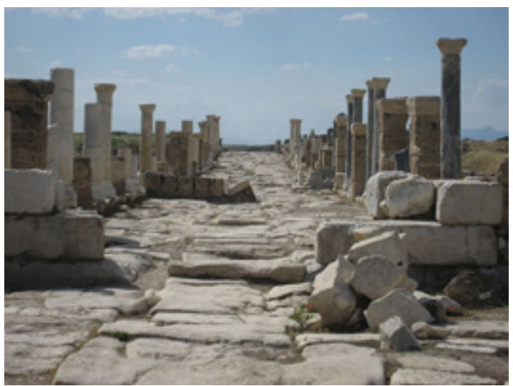
Colonnaded street in Laodicea

The economic base of the city was built from trade with its location at the intersection of major trade routes. The western gate for entering the city was known as the Ephesian Gate, while on the east side of the city the entrance gate was known as the Antioch Gate. The production of a highly prized soft black wool in the region contributed to the economy greatly, as well as a medical school that served the needs of Phrygia and beyond.