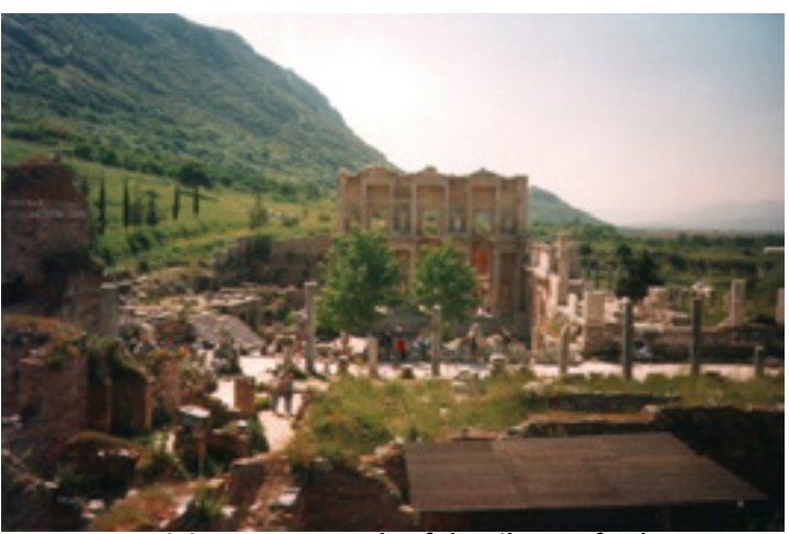
Remaining Front Fascade of the Library of Celsus

<sup>30</sup>"Strabo (Geog. 641–42) was correct in noting the significance of Ephesus' location as one of the many reasons for its commercial growth. In addition to its propitious littoral situation, it was also part of a principal trans-Anatolian highway system that had been in use for centuries (Birmingham 1961). In Strabo's words it was a 'common road constantly used by all who travel from Ephesus toward the East' (Geog. 663). The fact that Republican period milestones from Asia used Ephesus as the point of origin for measuring distances portrays the continuing significance of this site as a travel hub at the period contemporary with nascent Christianity. Furthermore, the city was also the hub of regional urban development. Ephesus had successfully annexed several adjacent suburban areas; NW to Metropolis, S toward Magnesia and Priene, and E 40 km into the Cayster valley. However, unlike other Ionion cities such as Miletus (Boardman 1980: 238-55), Ephesus is not known to have established colonies in other regions, though Hecataeus