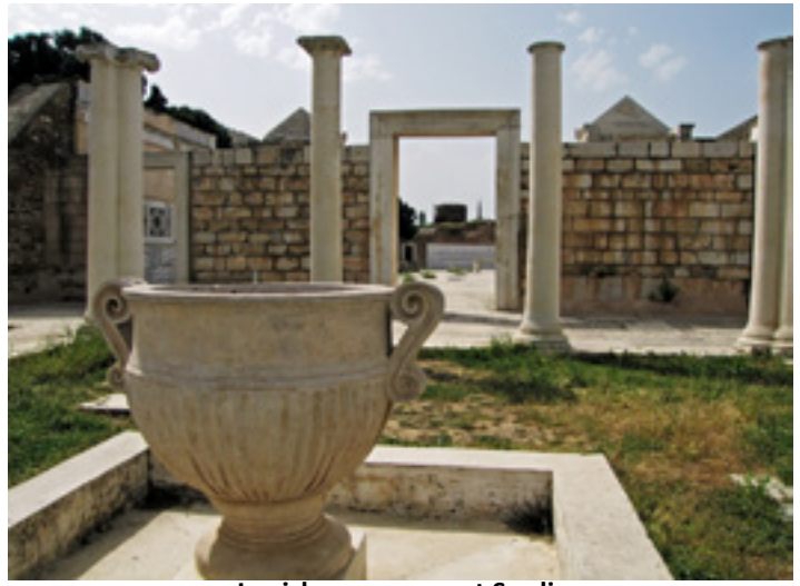
Jewish synagogue at Sardis